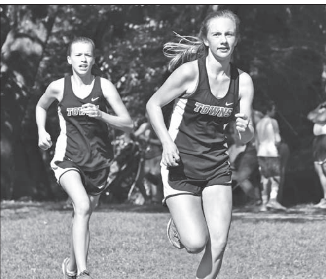
TCHS looks to continue its dominance of the Area Championships when they travel to Georgia Military College.